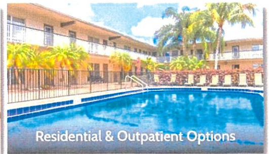
Residential & Outpatient Options