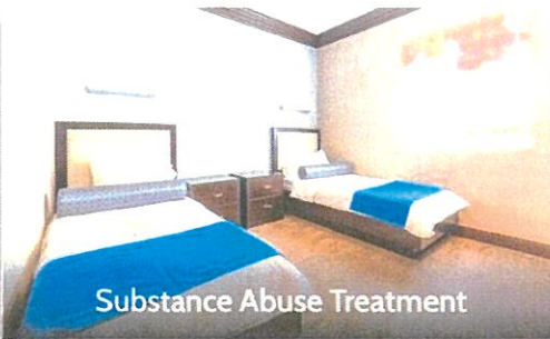
Substance Abuse Treatment