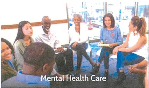
Mental Health Care

Job protection is available to you as a service of your local union.